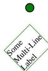
Figure 11-2: Label example

from reportlab.graphics import shapes from reportlab.graphics.charts.textlabels import Label d = Drawing(200, 100) # mark the origin of the label d.add(Circle(100,90, 5, fillColor=colors.green)) lab = Label() lab.setOrigin(100,90) lab.boxAnchor = 'ne' lab.angle = 45 lab.dx = 0 lab.dy = -20 lab.boxStrokeColor = colors.green lab.setText('Some Multi-Line Label') d.add(lab)